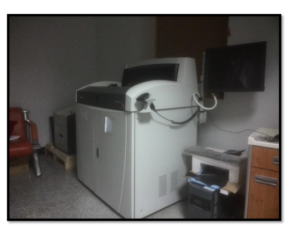
Fig. (3) Computed radiography