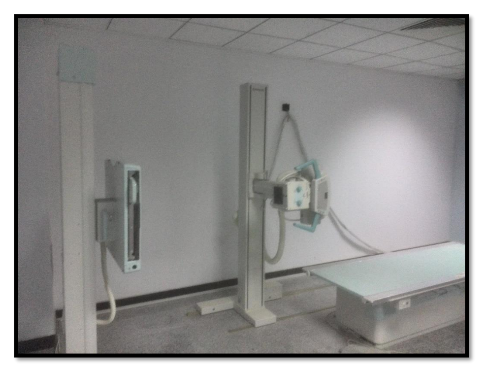
Fig (2) Conventional X-ray unit